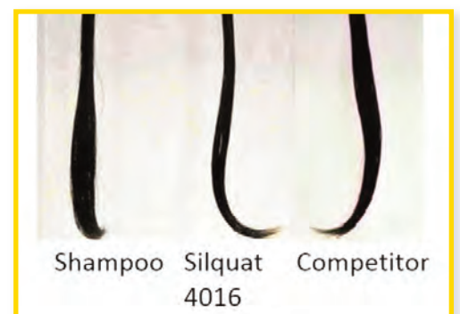
FIGURE 1:TRESSES TREATED WITH GEL