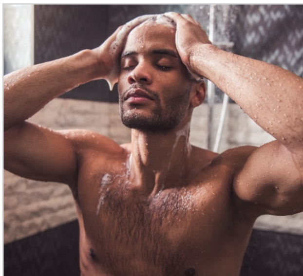
IDEAL FOR SHAMPOO AND BODY WASH!